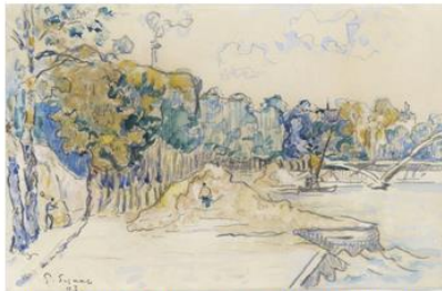
[Paris, la passerelle Debilly, 1903 by Paul Signac. Stoppenbach Delestre.]

"London Art Week' is a key moment of the year which celebrates the resounding importance of the art gallery. It also highlights the position of Mayfair and St. James's as the global centre of the traditional art market, and the leading destination for expertise. We look forward to welcoming collectors, curators and enthusiasts to this year's event which will offer the strongest and most diverse selection of art to date."