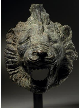
[Lion Mask, Roman, 1st-2nd century AD. Tomasso Brothers Fine Art]