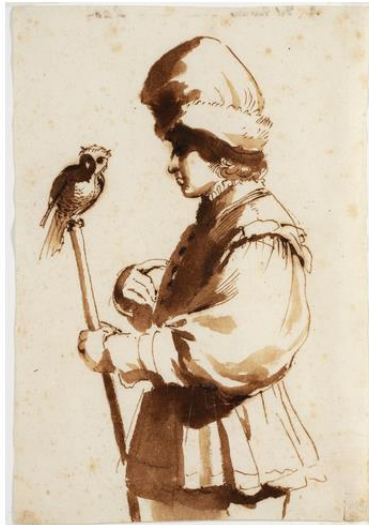
[Stephen Ongpin Fine Art. A Young Man with an Owl on a stick. Giovanni Francesco Barbieri.]