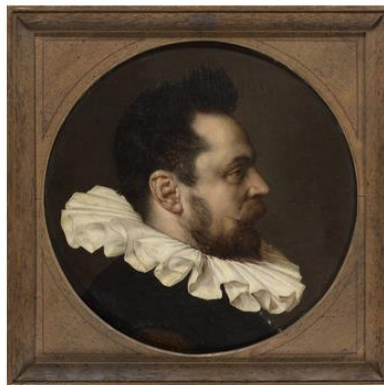
[Agnews. Portrait of a gentleman, bust-length, in a white ruff]

London Art Week (3 to 10 July 2015) is the most important gallery-based celebration of traditional art, highlighting the unrivalled quality, riches and expertise available within the galleries of Mayfair and St. James's.