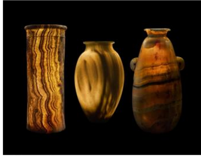
[Ariadne Egyptian Vases]