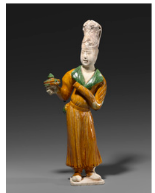
J J Lally & Co. will display a glazed pottery foreigner with an offering, Tang Dynasty, A.D. 8th century.